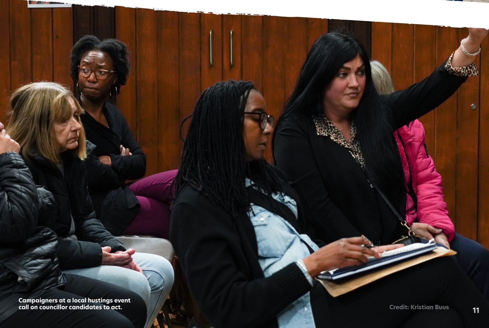
Campaigners at a local hustings event call on councillor candidates to act.