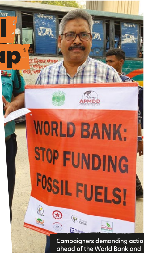
Campaigners demanding action ahead of the World Bank and IMF meetings this October

Lower income countries are currently in the worst debt crisis for 25 years. Intensified by the pandemic and rocketing interest rates, debt payments to lenders such as big banks and hedge funds, or multilateral banks like the World Bank and International Monetary Fund (IMF) increased 150% from 2011 to 2023. 54 countries are now in debt crisis, which means that their debt payments are so high they are forced to cut back on funding