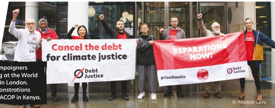
Right: Campaigners protesting at the World Bank HQ in London. Top: Demonstrations against EACOP in Kenya.

Uganda in West Africa took out a $1 billion loan from the IMF in 2021. According to civil society groups, the conditions of the loan were that the government should take a “hands-off approach to the country’s development and to place greater priority on the oil and gas sector” to pay down the debt. The Ugandan government has allocated some of this loan to build the East Africa Crude Oil Pipeline (EACOP), intended to transport oil from Uganda to Tanzania. It is projected that EACOP will fuel the climate crisis by