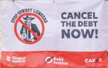
Left and bottom: Debt campaigners at the 2023 Labour Party Conference in Liverpool