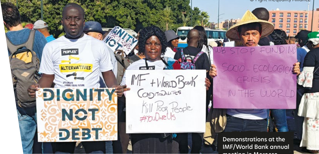
Demonstrations at the IMF/World Bank annual meeting in Morocco.

facilitating oil extraction, generating over 34 million tons of CO 2 emissions a year. Over 260 organisations have come together with local groups as part of the 'Stop EACOP' campaign to prevent the pipeline being built.